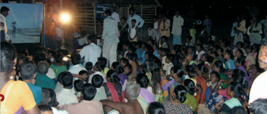
Screening the film on Coastal Regulation Zone in Tiruvengadu, Sirkali Taluk