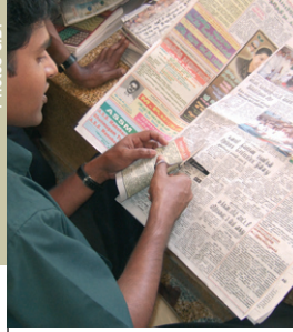
Selection of articles from the Tamil press