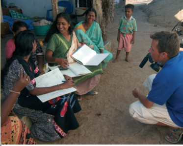
Preparation of the materials on Livelihood: filming a Sangam in Kanyakumari district

RDC website – www.rdc.net.in is an interactive source of information, hosted and maintained by CED. Using its advanced search engine, anyone can search through the extensive documentation database and download documents such as articles, videos, press clippings... The website structure allows each partner to update it at any time with articles, news or documentation.