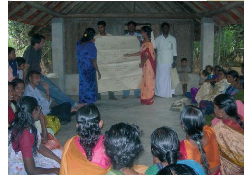
Raising awareness in Kanyakumari district

Equipped with a connected computer, newspapers, information materials and books, the VKC are the local access and dissemination points for the RDC. A young, trained, local volunteer welcomes the visitors from surrounding villages, and guides them through their inquiry. The Knowledge Centres are also the place for raising community awareness, and for people to share their experience and knowledge through production of materials. Local people (with a focus on youth and women) will be trained in the use of ICT and multimedia tools.