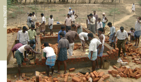
Masons training lead by TNDTF in Konayampattinam, Sirkali Taluk (construction of a model house)