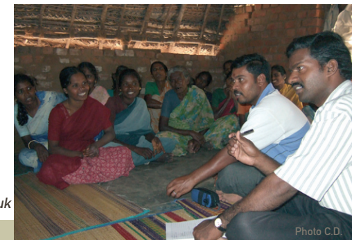
Community meeting in Sirkali Taluk